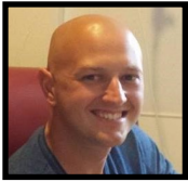
By: Josh Hawley