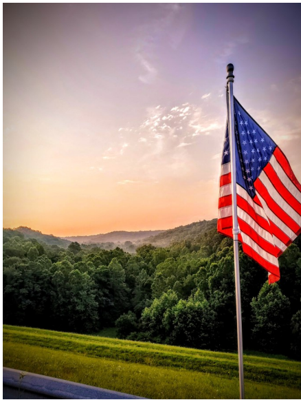
Another beautiful sunrise on Cordry Dam. Just a few more weeks left to enjoy the flags until next spring!